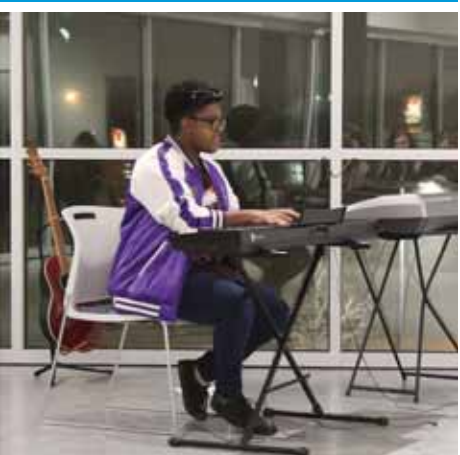
1,818 Youth First visits by LGBTQ teens and allies