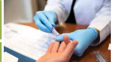
$60 provides HIV testing, counseling and a safe-sex kit for an at-risk individual in our HIV Prevention program

$60 provides healthy, fresh groceries for a person living with HIV for one month