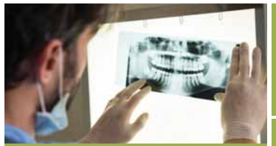
$150 provides a routine appointment for a person living with HIV at the HIV Dental Clinic

$100 provides an educational speaker for a GenderBrave event