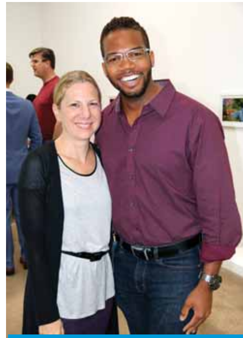
Young Professionals gather in support of Youth <u>First</u>